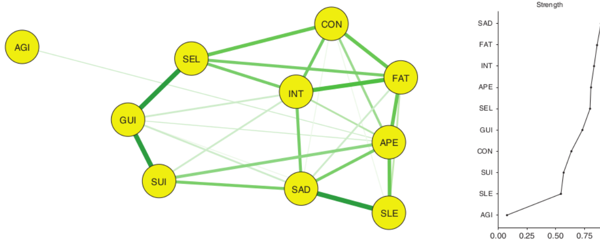
Fig. 1 Network analysis of the depressive symptom profiles in Asian patients with depressive disorder overall ( n = 1174). AGI, agitated or slowed movements; APE, decreased or increased appetite; CON, poor concentration or indecisiveness; FAT, fatigue or low energy; GUI, guilt or self-blame; INT, loss of interest or pleasure; SAD, persistent sadness or low mood; SEL, low self-confidence; SLE, disturbed sleep; SUI, suicidal thoughts or acts.

HIC, high-income country; MIC, middle-income country.